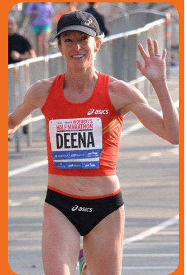
Top secret training...