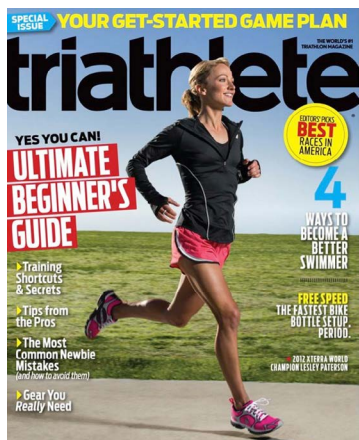
Editor's Pick June Lake Triathlon Among Nation's Best Triathlons