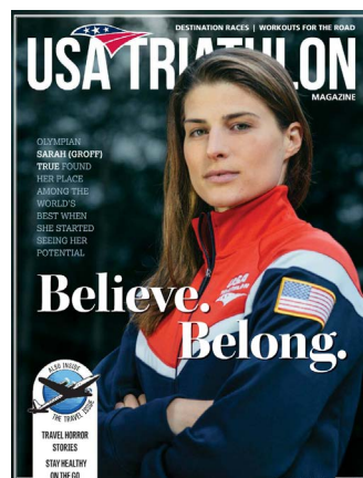
June Lake Triathlon Chosen as Nation's Top Destination Race