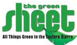
June Lake Triathlon Goes Green with Solar