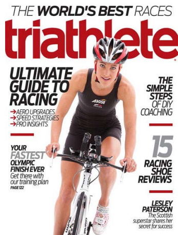
Come and race what Triathlete Magazine calls one of it's "all-time favorite races."